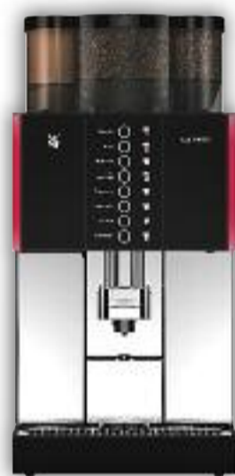
Version with 2 grinders, choc, illumination. 8 keys allocated.