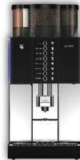
Version with 2 grinders, twin choc, illumination. 8 keys allocated.