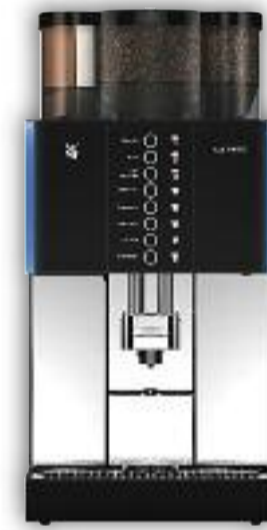
Version with 2 grinders, twin topping, illumination. 8 keys allocated.