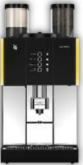
Version with 1 grinder, topping, illumination. 4 keys allocated.