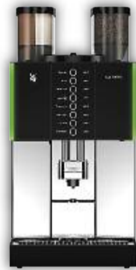
Version with 1 grinder, twin topping, illumination. 8 keys allocated.