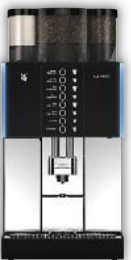
Version with 2 grinders, topping, illumination. 8 keys allocated.