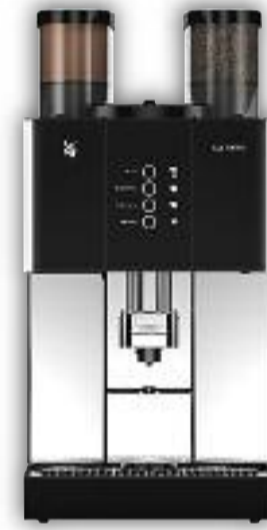
Version with 1 grinder, choc, no illumination. 4 keys allocated.