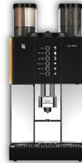
Version with 1 grinder, twin choc, illumination. 6 keys allocated.