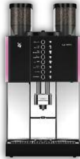
Version with 1 grinder (left-hand one is inactive) or 2 grinders, illumination. 8 keys allocated.

Its proven modular design ensures the WMF 1800 S will fit in perfectly at the place of use. The machine can be equipped with one or two grinders and with a chocolate, topping, twin chocolate or twin topping hopper, as desired. Extra security for self-service use: all hoppers have a lockable lid.